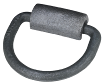
CCDR037FW (L 2.75" x W 3.4")

3/8" FORGED D-RING w/ WELD-ON CLIP (WLL: 3,000 LBS / 1,361 KGS)