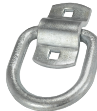
CCDR050FBSZ (L 3.5" x W 3.4")

3/8" WELDED WIRE D-RING w/ BOLT-ON CLIP (WLL: 1,667 LBS / 756 KGS)