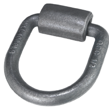
CCDR050FW (L 3.5" x W 3.4")

3/8" FORGED D-RING w/ WELD-ON CLIP (WLL: 3,000 LBS / 1,361 KGS)