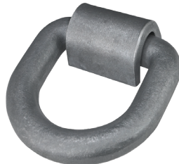
CCDR100FWS (L 5" x W 5")

3/4" FORGED D-RING w/ WELD-ON CLIP (WLL: 9,000 LBS / 4,082 KGS)