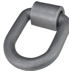
CCDR100FWL (L 6" x W 5")

1" FORGED D-RING w/ WELD-ON CLIP - SHORT (WLL: 15,600 LBS / 7,076 KGS)