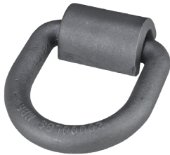
CCDR075FW (L 4.5" x W 4.5")

5/8" FORGED BENT D-RING w/ WELD-ON CLIP (WLL: 6,300 LBS / 2,858 KGS)