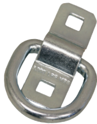
CCDR037B (L 2.37" x W 2.35")

1/4" WELDED WIRE D-RING w/ BOLT-ON CLIP (WLL: 400 LBS / 181 KGS)