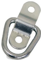
CCDR025B (L 1.75" x W 1.5")

1" FORGED BENT D-RING w/ WELD-ON CLIP (WLL: 15,600 LBS / 7,076 KGS)