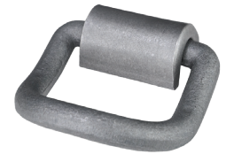
CCDR062FBW (L 4.0" x W 4.5" x H 2")

5/8" FORGED D-RING w/ WELD-ON CLIP (WLL: 6,300 LBS / 2,858 KGS)