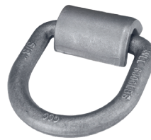
CCDR062FW (L 4.3" x W 4.3")

1/2" FORGED D-RING w/ WELD-ON CLIP (WLL: 4,000 LBS / 1,814 KGS)