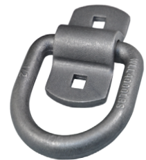
CCDR050FB (L 3.5" x W 3.4")

1/2" FORGED D-RING w/ BOLT-ON CLIP - SILVER ZINC (WLL: 4,000 LBS / 1,814 KGS)