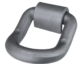
CCDR100FBW (L 5.4" x W 5" x H 2.6")

1" FORGED D-RING w/ WELD-ON CLIP - LONG (WLL: 15,600 LBS / 7,076 KGS)